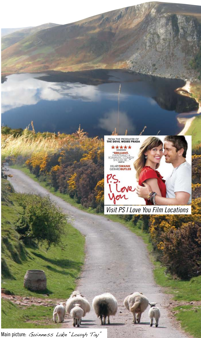
Main picture: Guinness Lake "Lough Tay"